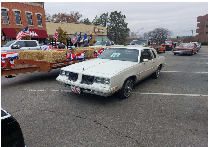
1983 Oldsmobile Cutlass Supreme Joe Arneson