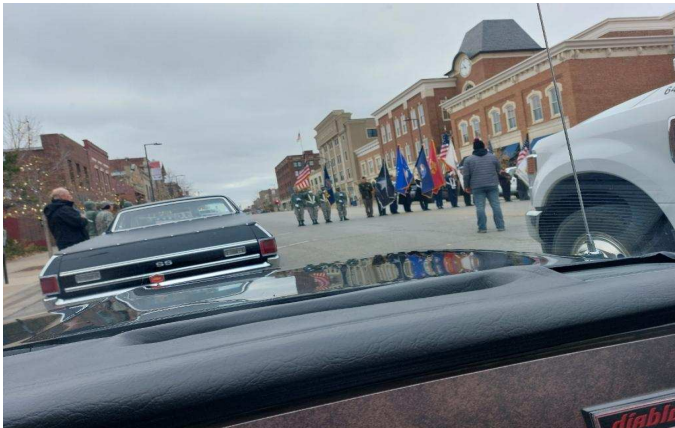
Military personnel lining up to lead the parade.

Several of our club members attended and participated in the Veteran's Day parade on Saturday, November 12th, in downtown Lawrence, Kansas. Their beautiful cars were really a hit and appreciated by the large crowd.