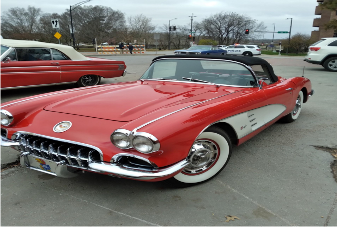
1960 Chevrolet Corvette Pete Maxon