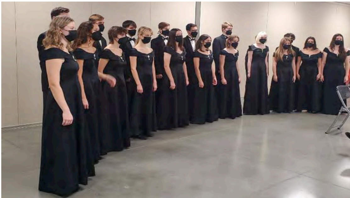
Members of the Lawrence High School Honor Choir