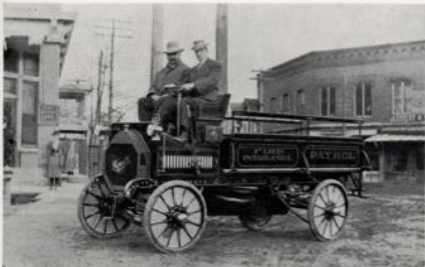
Sharp indeed! Note the disk wheels and position of the coil box . . . and the impeccable dress of the passengers.