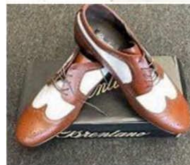
Left: 3/4 Business/Dress Shoes. Pictured is an original era ad and a reproduction Madison Boot from Stacey Adams.