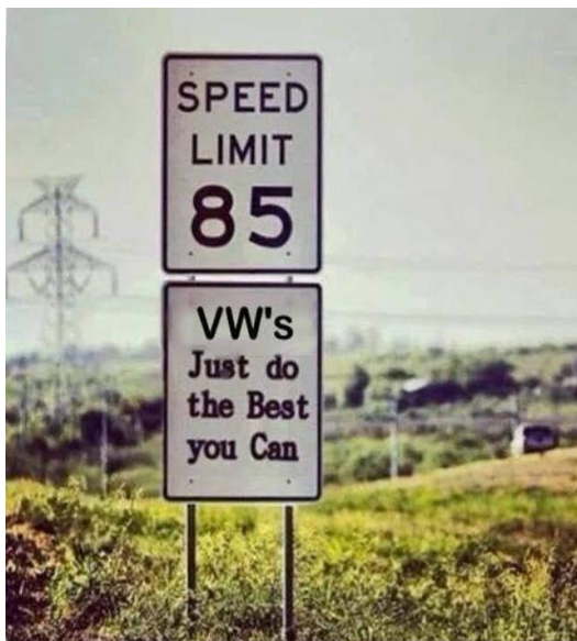
Submitted by Tim Cragg