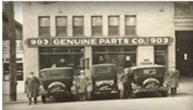
The first NAPA store opened in 1936

NAPA Auto Parts started in 1925, when a group of independent auto parts sellers met in Detroit to form the National Automotive Parts Association. With people increasingly relying on cars and trucks for transportation and business, they saw the need to improve the distribution of automobile parts around the country. The organization set standards for the parts they sold, and NAPA stores and warehouses, owned by member companies, quickly became known as a place to get reliable parts. The crash of 1929 and the following depression increased the demand for repair parts as older vehicles were kept in use. Over the years, one company gradually bought out the other members, and the NAPA name became a brand.