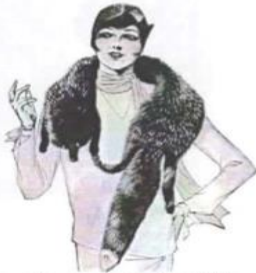
"Silver fox color Manchurian Wolf." Actually Chinese dog, dyed and pointed to resemble silver fox. National Bellas Hess Fall/Winter 1928

Heat and Light. Heat dries out the oils in the leather, which leads to hair loss and tears in fragile seams and skins. Vintage furs cannot be "re-oiled," so it is of utmost importance to not expose furs to heat. An unheated closet is a good storage place, provided the fur will not get too cold and freeze. Strong sunlight will also discolor furs. Undyed furs will fade; white furs will turn yellow; and even dyed dark furs will change shades when exposed to sunlight.