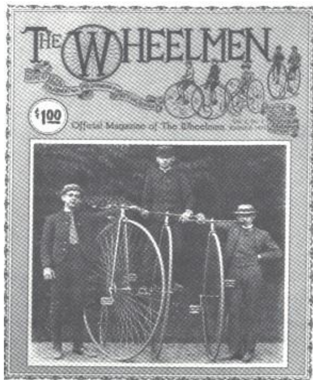
The Wheelmen Magazine

EDITOR NOTE: The Wheelmen club was founded in 1967 and includes bicycles from pre-1918 to 1932 and before. By their website they have a very active group and are still going strong. The website also includes a large amount of information and history of these bicycles. For more information the website is: https://thewheelmen.org/