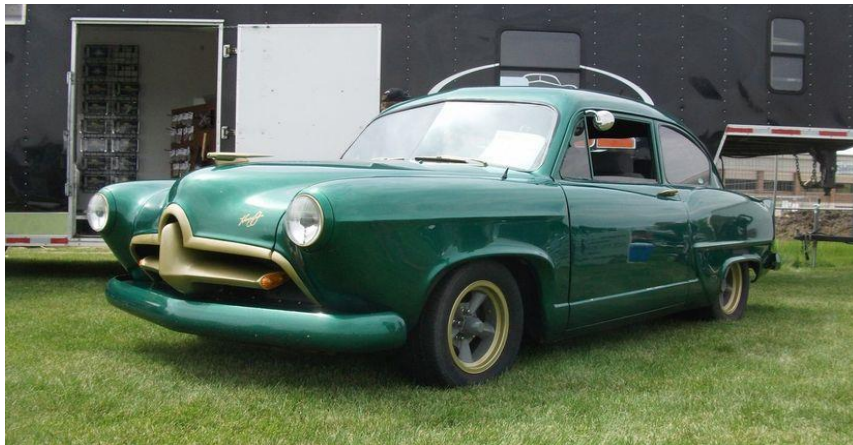
1950 HENRY J

The Henry J is named for the chairman of the Kaiser-Frazer Corporation, Henry J. Kaiser. The Henry J was designed to truly be a car for everyone, cheaper than any other car on the market at only $1,300. To make it work at such a low cost it had fixed rear windows, there were no arm rests or a glove box.