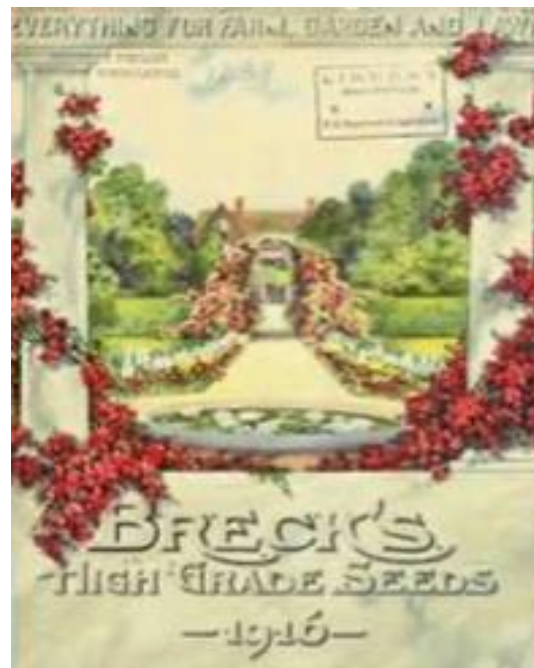
1916 Breck's Catalog Cover